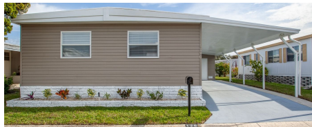
#1280 2BD/2BA $120,900.

#1278 - 2BD/2BA plus den. Corner Unit. This unit is 1977, 1152 sq ft. Galley semi-open floor kitchen. All white appliances. Beautiful built-in China cabinets located in the dining room. This home offers an additional living space located at the front of the home. This space could be used as a third bedroom or office space. The living room has a beautiful bay window for viewing. The primary bathroom has a walk-in shower with a walk-in closet. The roof was replaced two years ago, which has a transferable warranty. New AC/Heat installed 2026 with a 5-year warranty. Washer and dryer are located inside. Listed at $74,500