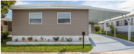
#1093 3BD/2BA $119,900.