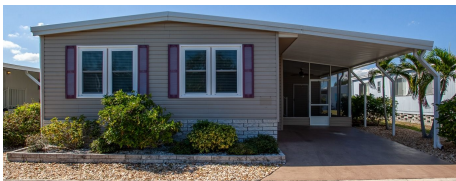
#1221 2BD/2BA $82,500.