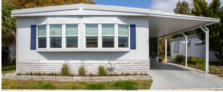
#1027 2BD/2BA $74,900.