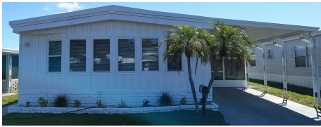
#1059 2BD/2BA $125,900.