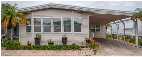
#1186 3BD/2BA $125,500.