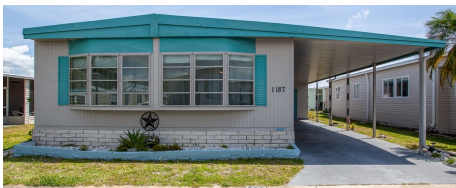
#1187 2BD/2BA $45,900.